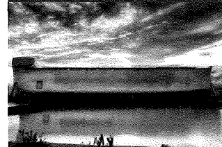
Enjoy a Visit to the Famous Ark Encounter