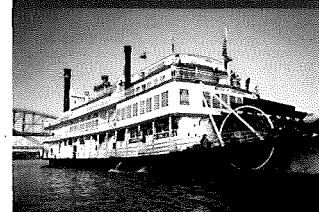
Enjoy a BB Riverboats Sightseeing Cruise